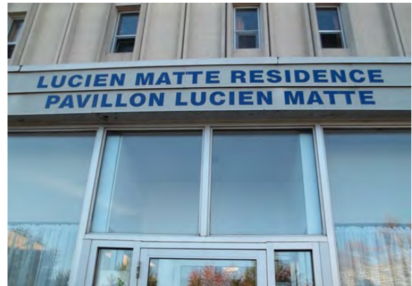
Pavillon Lucien Matte