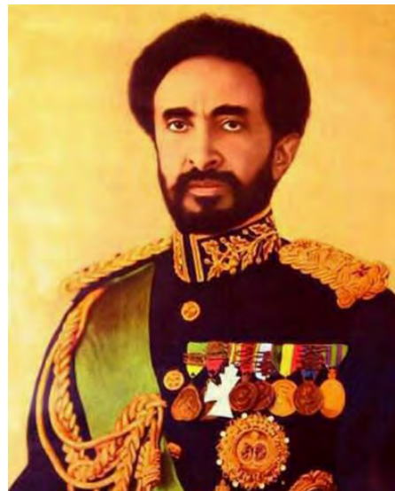
Emperor Haile Sélaissé 1st, with his real name: Tafari Makonnen

At the end of the Second World War (1945), Emperor Haile Selassie of Ethiopia, who was in exile in England, due to Italy's colonial domination of his country, returned to Ethiopia. Having known Jesuits and their method of teaching during his exile, he entered into communication with the superior general of the Jesuits. The emperor asked him to have, as missionaries, Jesuits of French Canadian nationality who could work in English, to build a high-level education system for his Ethiopian people.