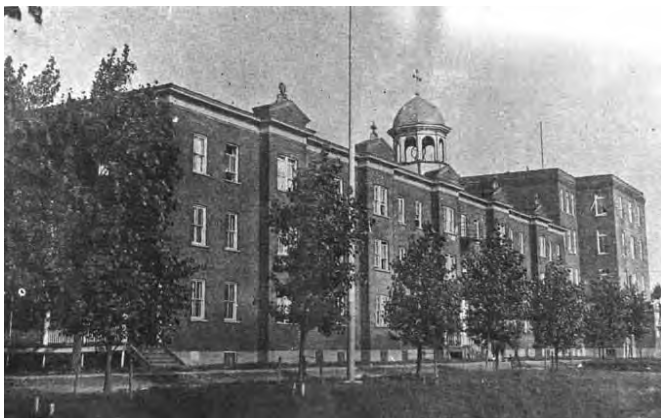
Collège Sacré-Cœur of Sudbury