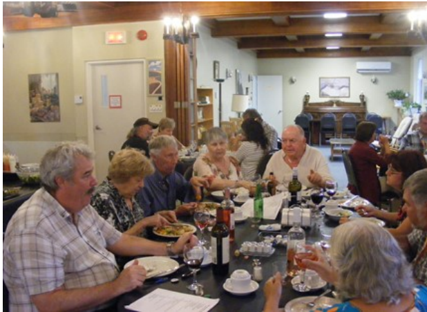
Many Matte in great conversation...