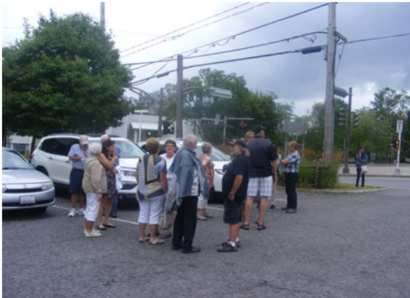
Arrival of several participants at the rally

Back at the Moulin des Jésuites, several guides in period costume were on hand to welcome us and to explain the historical aspect of this mill built by the Jesuits in 1742. Active for nearly 200 years, this former water mill ceased operation in 1940. Today there is a historical interpretation center.