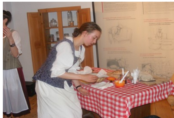
Tasting of bread from the outdoor bread oven at the Moulin des Jésuites