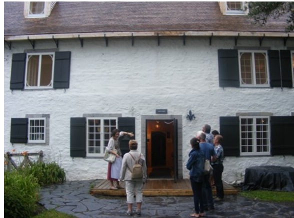
Moulin des Jésuites

The state of conservation of the mill and the bread oven found outside are impeccable. The bread oven was restored and remains a popular attraction for visitors. The inner visit of the mill ended with a tasting of homemade bread from the mill oven, based on the recipe used at that time. This moment was appreciated by all.